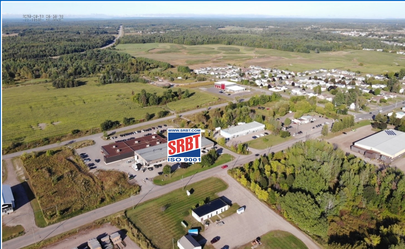
AERIAL PHOTOGRAPH OF THE FRONT OF SRBT'S FACILITY