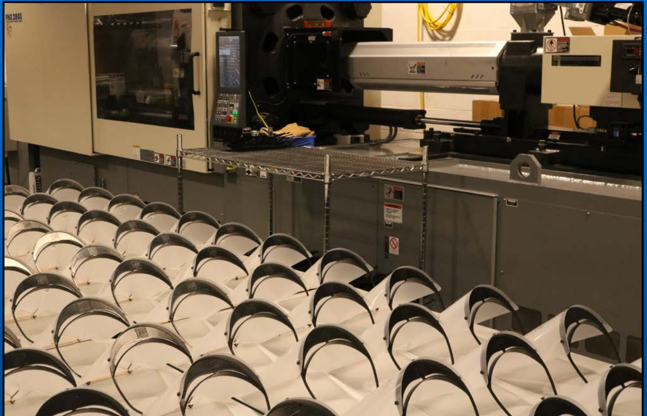
FACE SHIELDS PRODUCED BY SRBT TO HELP FIGHT COVID 19