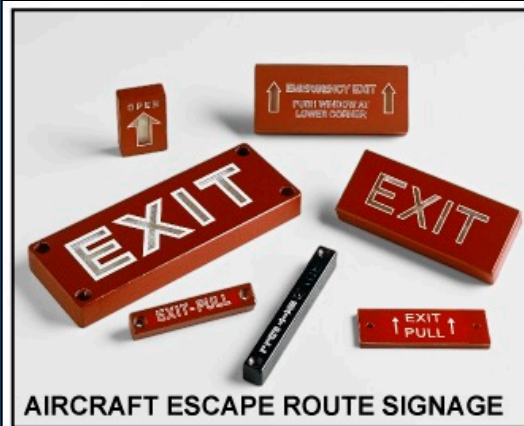
AIRCRAFT ESCAPE ROUTE SIGNAGE