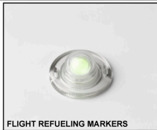
FLIGHT REFUELING MARKERS