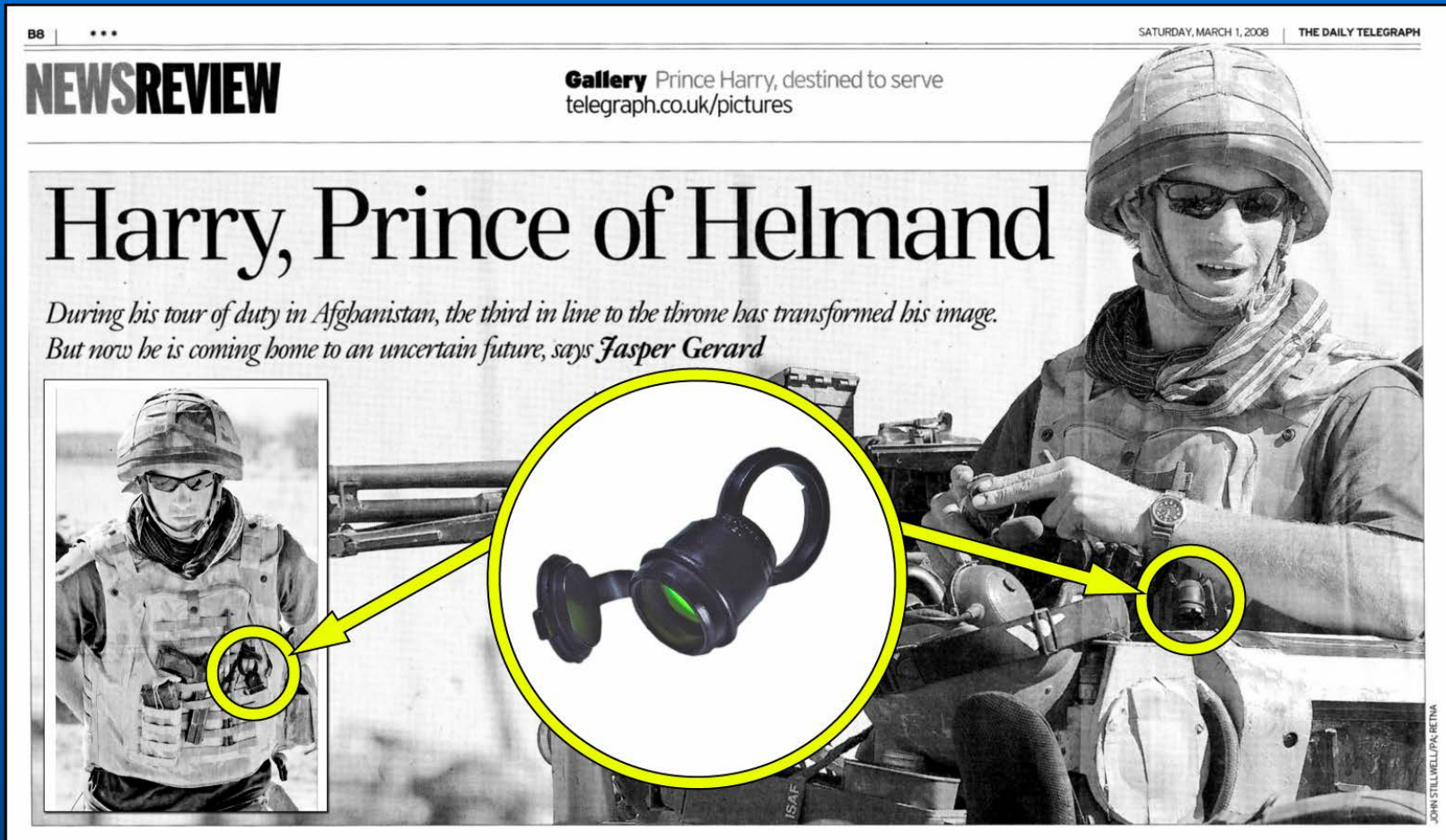
PICTURE OF A SOLDIER WITH OUR ILLUMINATED TORCH