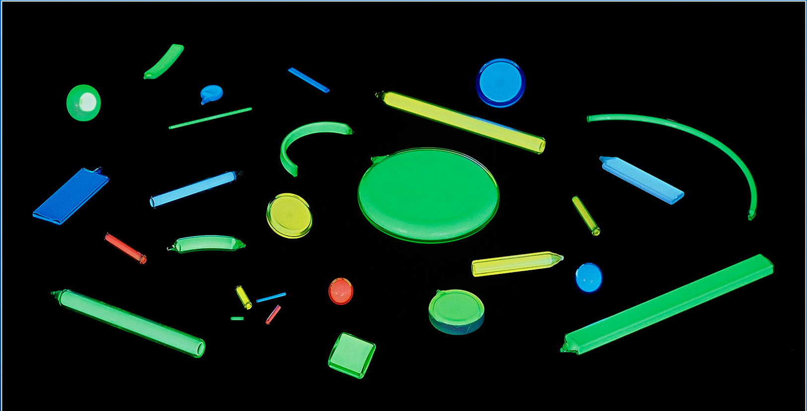
VARIOUS TYPES OF TRITIUM LIGHT SOURCES PRODUCED BY SRBT