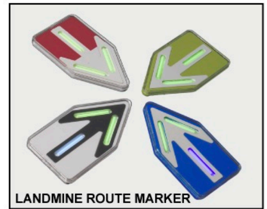
LANDMINE ROUTE MARKER

VARIOUS TYPES OF PRODUCTS PRODUCED BY SRBT