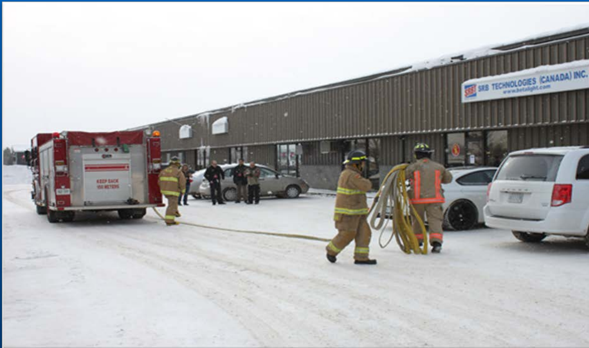
EMERGENCY EXERCISE, FEBRUARY 9, 2015