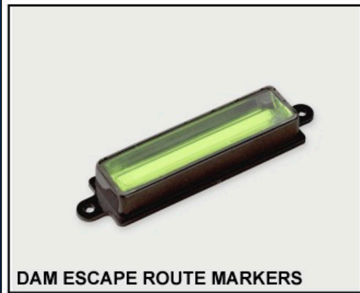
DAM ESCAPE ROUTE MARKERS