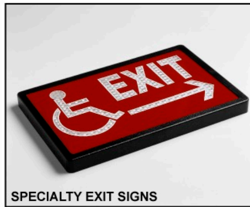
SPECIALTY EXIT SIGNS